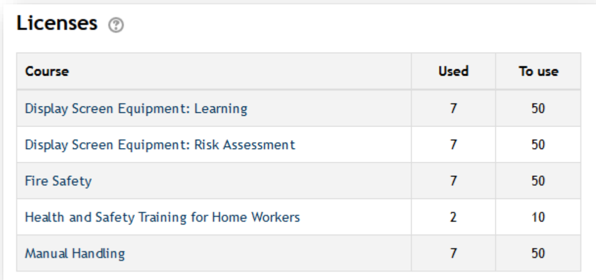
Figure 2 - The Licenses Screen